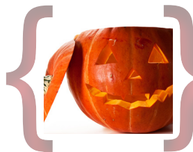
YOUTH & ADULT EVENING ACTIVITIES PG 7 & 16